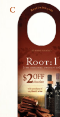
$2 Off Chocolate Wine Purchase req.