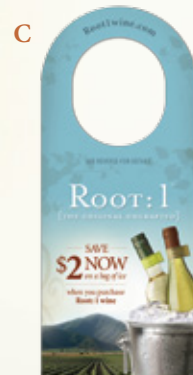
$2 Off Ice Wine Purchase req.