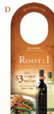
$3 Off Meat or Poultry Wine Purchase req.